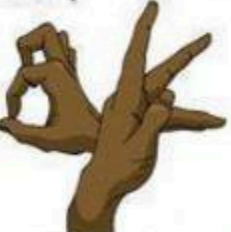
b.k blood killa